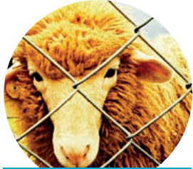
Use quality fencing