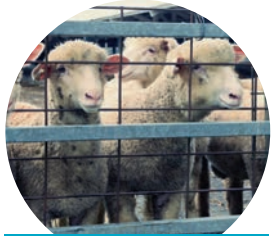
Quarantine new sheep